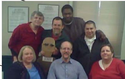
Men's Collective Meeting

“The program has exceeded my expectations”