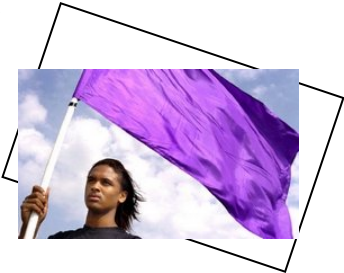
Peace in the Streets Rally 2009

100% of youth clients agree that they were treated with respect by CFN staff